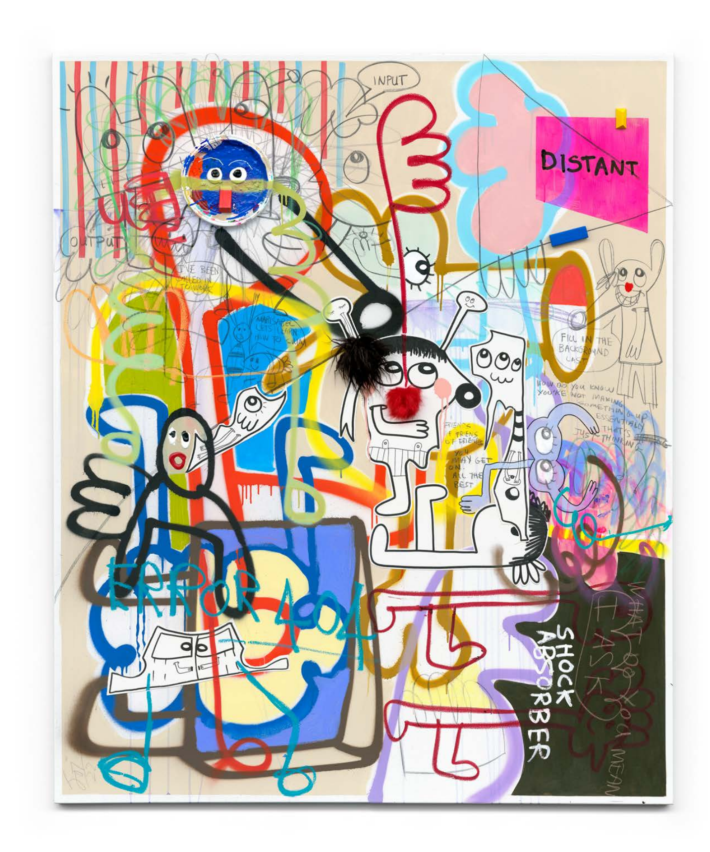
Quizas, Quizas, 2022

Acrylic, oil stick, wax crayon, spray paint, charcoal, collage on canvas 183x152cm